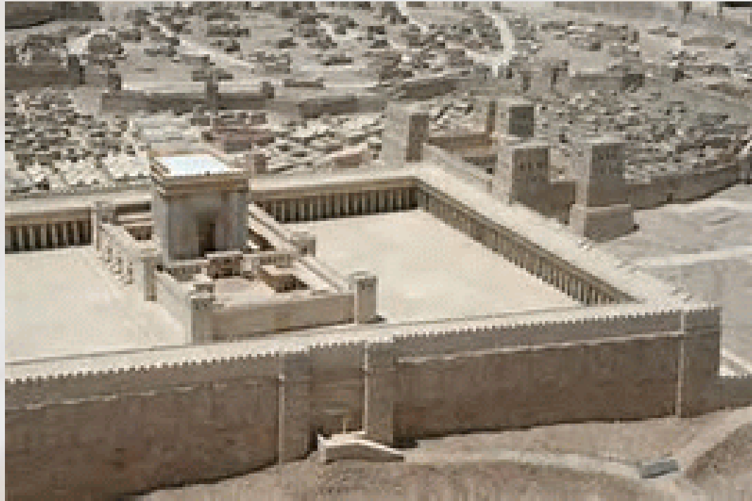
Castle of Antonia – NW of the Temple