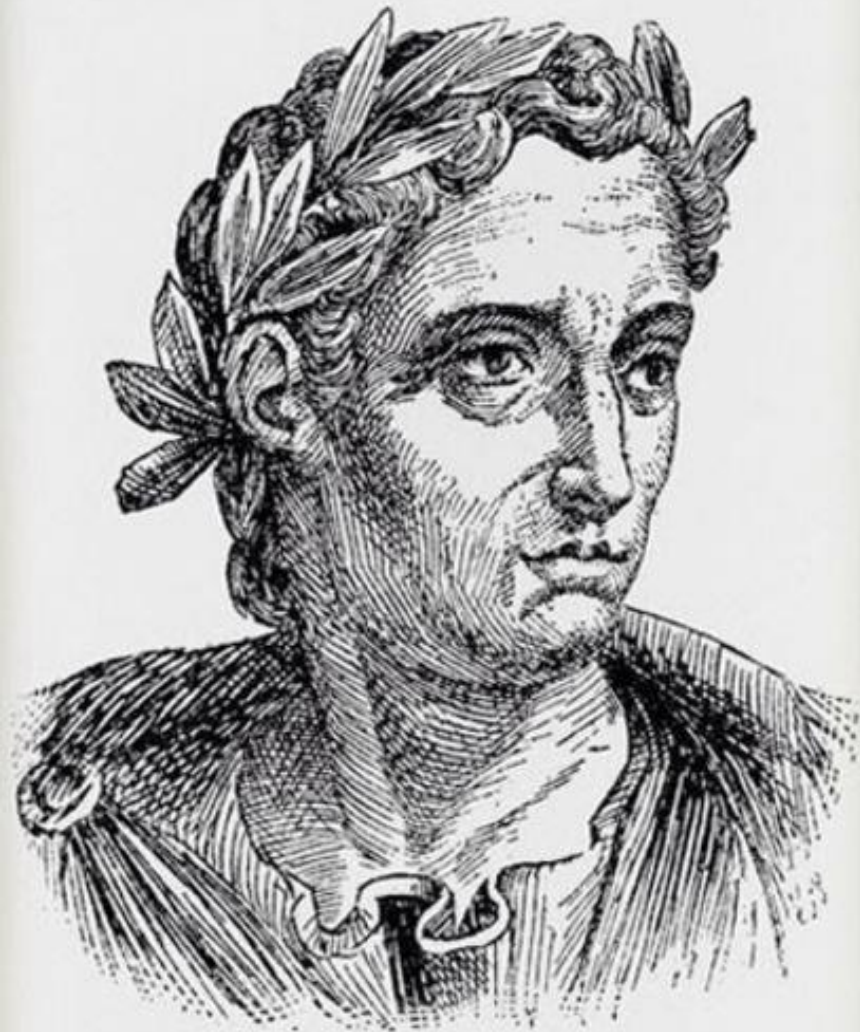
Pliny the Younger A.D. 61 - 113